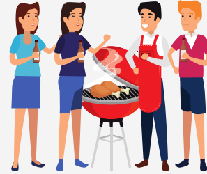
BBQ with colleagues or classmates