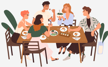
A dinner party with friends