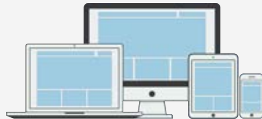
Use technology to supplement human connection