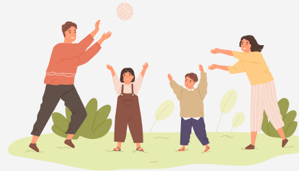
A sporting activity with the local kids