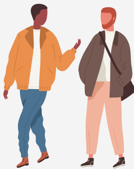
A walk with those you've been meaning to see