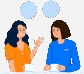
A coffee with a neighbour or colleague